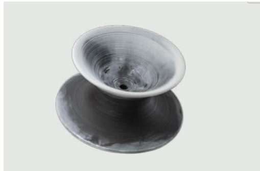
Bicolour - Grey Anthracite / Light grey