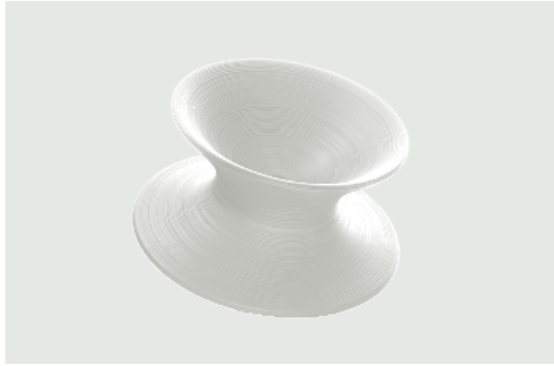
White 1735 C