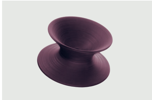
Dark Purple 1133 C