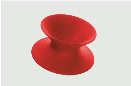
Red 1004 C