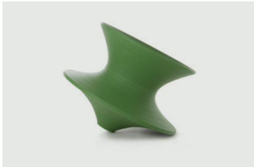
Green 1812 C