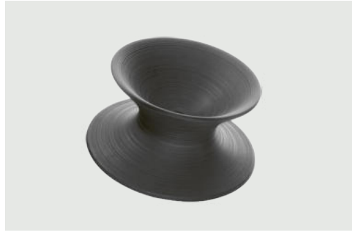
Grey Anthracite 1428 C